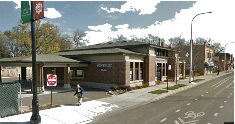
WINTRUST BANK - VIEW FROM N. ELSTON AVE