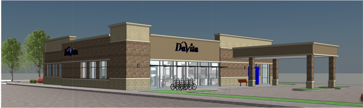
SOUTHWEST ELEVATION - VIEW FROM N. ELSTON AVE