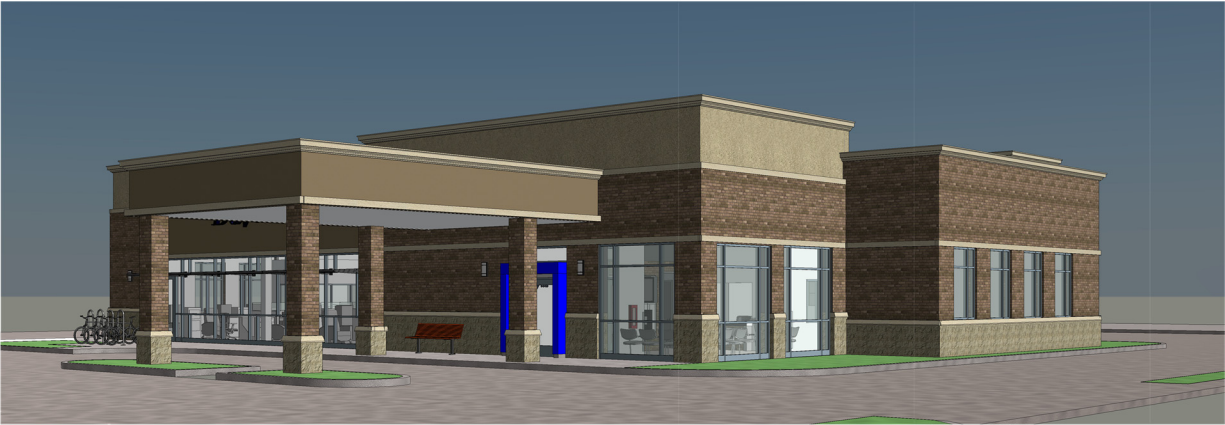
SOUTHEAST ELEVATION - VIEW FROM ALLEY