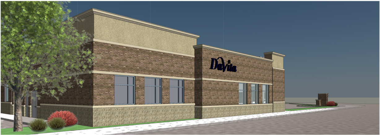
WEST ELEVATION - VIEW FROM N. PULASKI RD